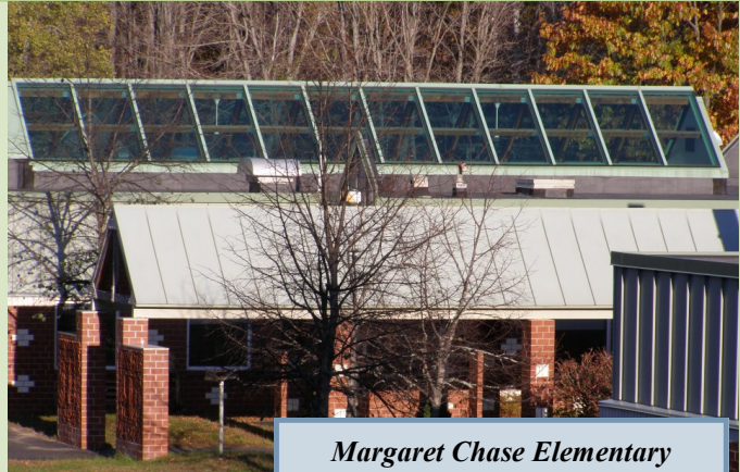
Margaret Chase Elementary School

Aluminum: Our aluminum contains in excess of 35% recycled content which also exceed LEED requirements.